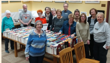
The Friday night set-up crew was all smiles!

to our 25 volunteers who helped a total of 51 hours for the April Book Sale. Friends raised a record $1,262 plus $11 in donations for a total of $1,273!